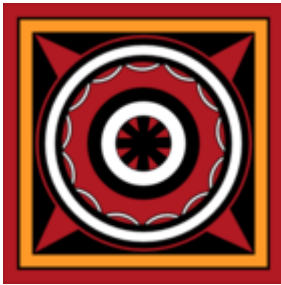
Traditional Bariallo in color

The goal of 'Petani Kopi Organik Toraja' is to produce the best (Organic, Fair Trade and Rainforest Alliance) Sulawesi Toraja Arabica available and to improve the livelihood of all farmers and their families, both socially and economically. The cooperatives' traditional Toraja belief in ornamentation is even seen in the exports of their coffee. The symbol for the sun, or Bariallo in the Torajan language, represents good health, luck and prosperity. To ensure all three for them and their families, the marking on their jute bags is the Bariallo.